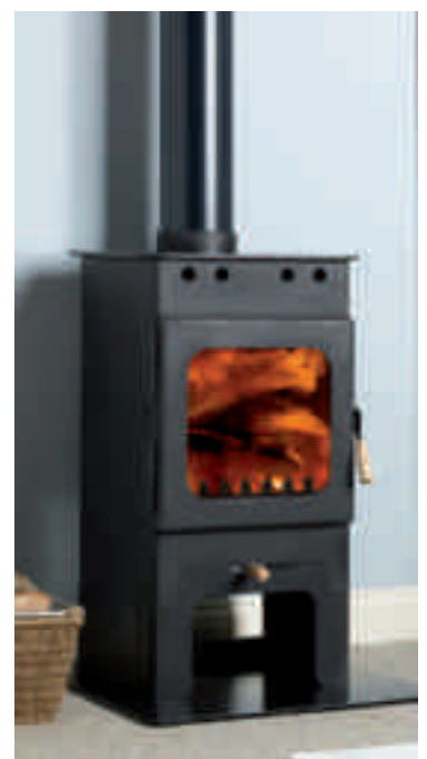
Hollywell shown with optional log store base but without cover plate.

An extended base is available for all models. This is the perfect accompaniment for stand alone installations where height needs to be emphasised. The base also doubles as an area for storing logs. This item is a separate component and fits to the standard height stove.