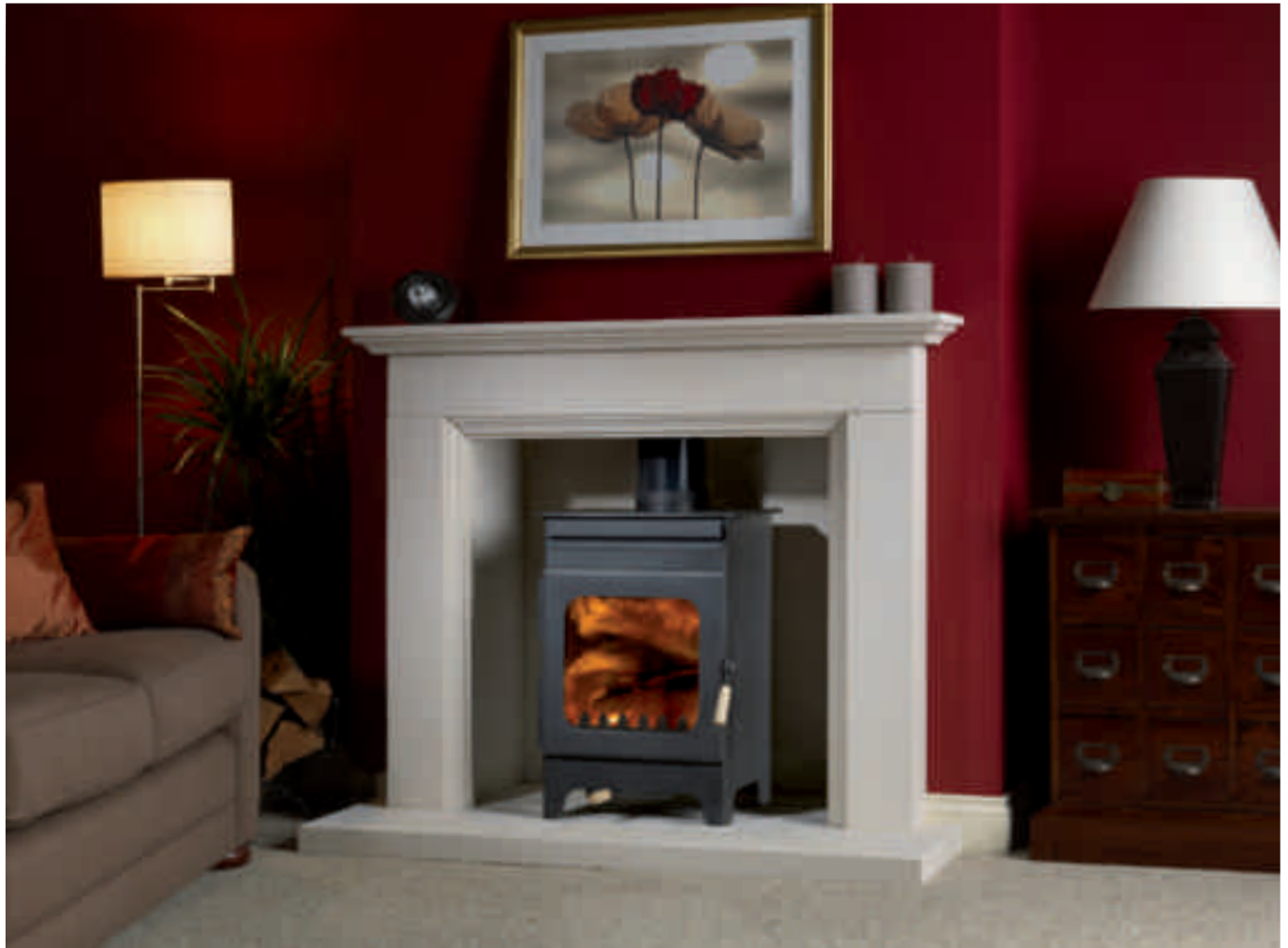
Hollywell 9105-5kW Shown with cover plate

"I absolutely love this stove. Watching flames dance is mesmerising and, with the lights turned down, it is very cosy and enjoyable. It is highly controllable too, have it blasting out lots of heat one moment and, with a flick of a lever, it will settle down to gently glow in 10 minutes. Wish I had done it years ago. Buy it – you won't regret it."